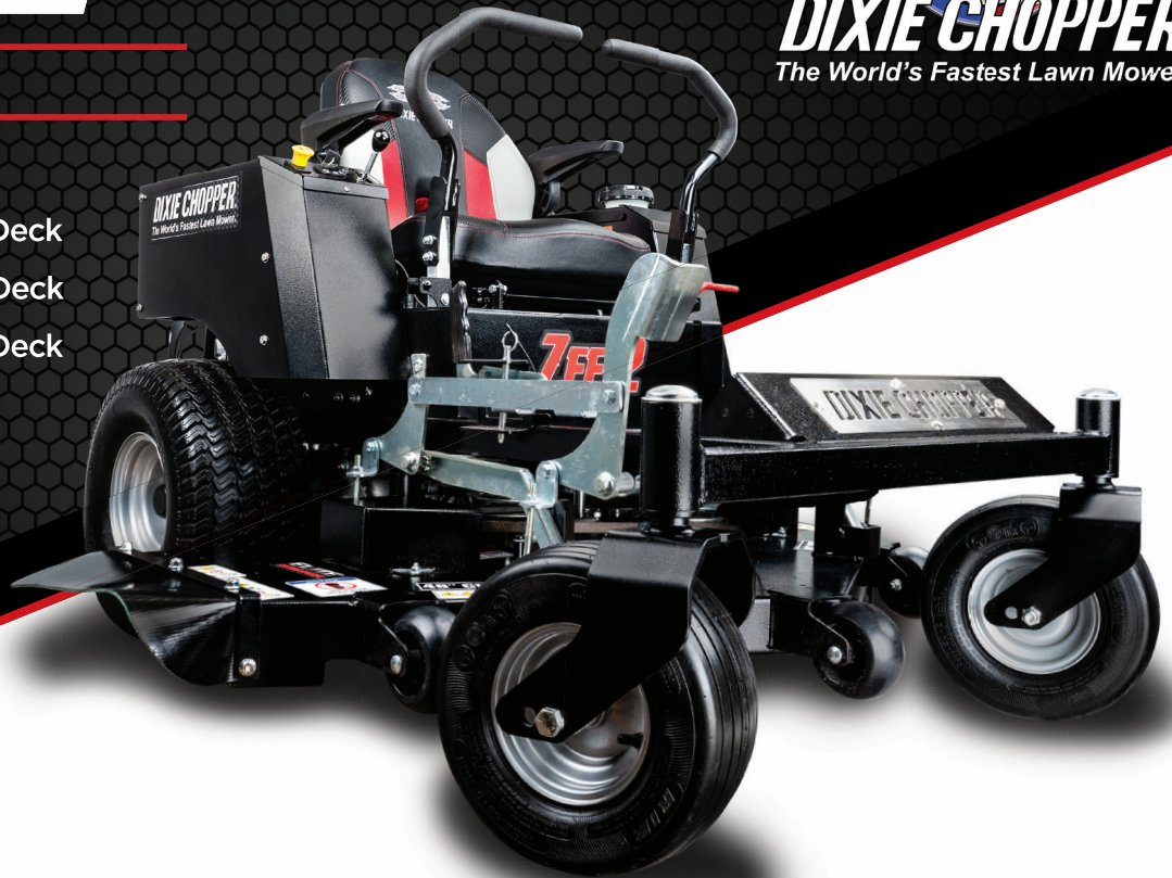
Zee 2 - 2348KW shown