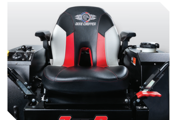
Comfort Ride - Plush cushioned seat with armrests for extra comfort