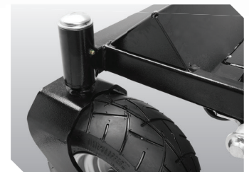
Commercial Forks - Greaseable and lifetime warranty against breakage