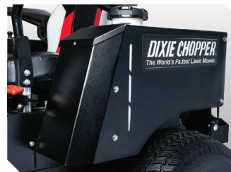
Steel Fenders - Protects fuel tank from sun and impact damage